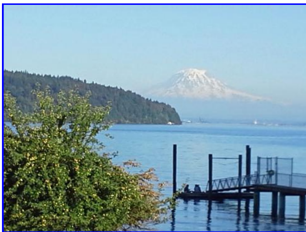
View from the Sea Cliff Beach Shelter

The picnic is a potluck. Please bring your own table service and a food item to share: a favorite dish or maybe something fresh from your garden!