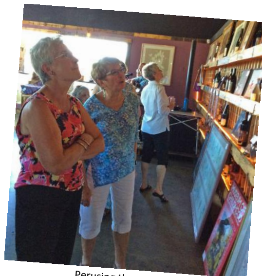
Perusing the artwork