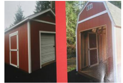
Key Peninsula Donation Station

A future goal is to link into the grocery recovery program which will enable FB4K to obtain food from grocery stores as they pull food that is near the expiration date.