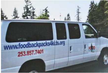
Van donated by Port Orchard Ford

Picking up and storing the food has proved a challenge. To help in the effort, a van was donated by Port Orchard Ford to transport food. A $25,000