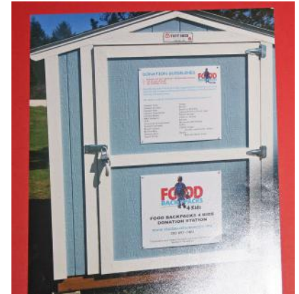
Purdy Donation Station

regional grant was awarded by Walmart to build donation stations where food is stored and where kids and families can come to pick up food. Two have been built, one in Purdy and another in Key Peninsula. Nine more are planned.